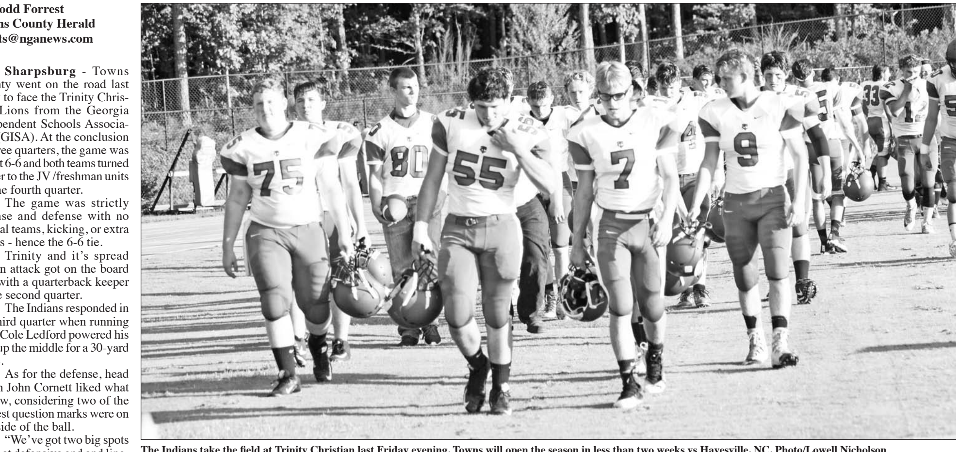
The Indians take the field at Trinity Christian last Friday evening. Towns will open the season in less than two weeks vs Hayesville, NC.